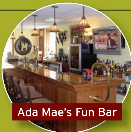
Ada Mae's Fun Bar

Seating available for up to 36 upstairs in Ada Mae's Fun Bar for private parties